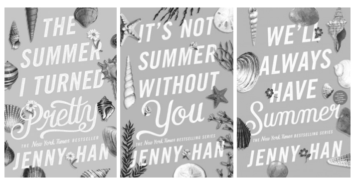
Figure 4 – Summer trilogy covers

Jenny Han is the author of another trilogy, Burn for Burn , not yet translated or published in Portugal.