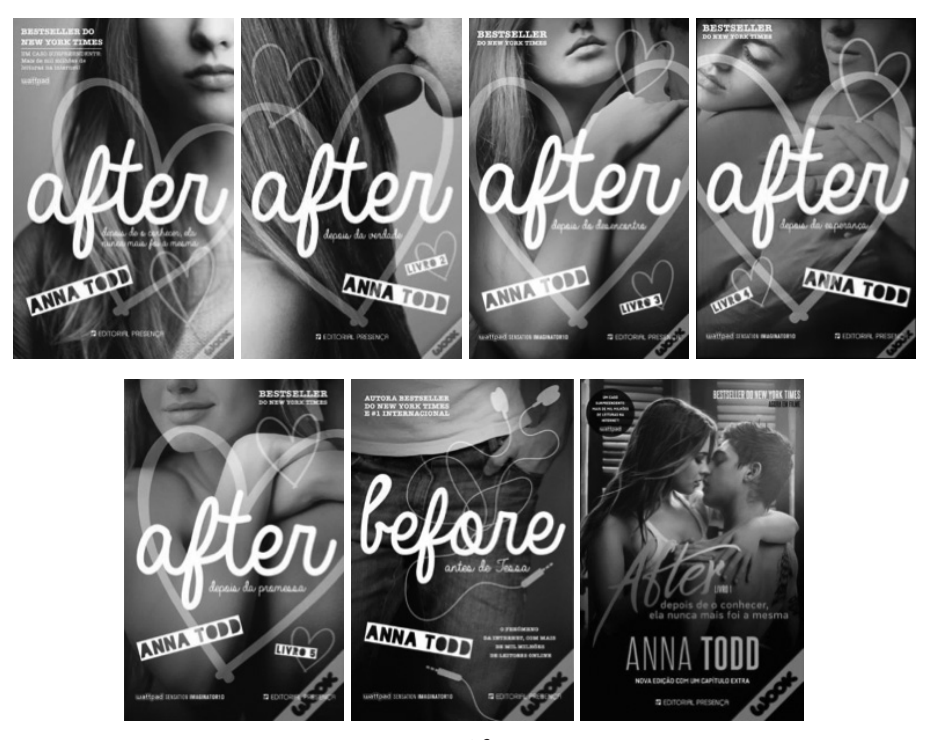
Figure 1 – After series

The author with most books present in the lists was Anna Todd. At that time, the books included in the top sales were those of "The Landon Series", a sort of spin-off series of the "After" collection (Fig. 1), a major success all around the world, with several volumes also present on the lists.