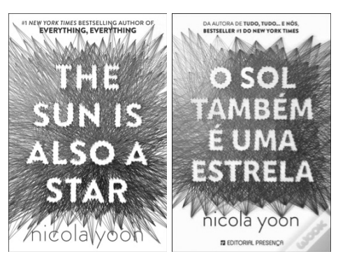
Figure 9 - Original and Portuguese cover

(2015), and Gayle Forman's Just One Day (2013) and Just One Year (2013). Even if the first two books by Levithan share some affinities with the fantasy novel, the narrative set and the main themes are quite realistic in the way the novels depict adolescent issues related with identity, family, friends and affection. In our research, only one book by each author was present on one of the lists, but since they are the result of a previous one, it seems relevant to underline this special relationship that is not built from a chronological perspective, as happens with sequels and prequels, but in an alternative narrative perspective, giving voice to a different character, and forcing the reader to question previous assumptions and judgments. These proposals seem relevant in developing not only a critical reading, but also in understanding the literary codes of fiction.