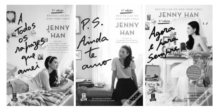
Figure 6 – Portuguese covers