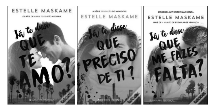
Figure 3 - Estelle Maskame's series

Anna Todd became such a significant reference in this segment of publication that other books published after the success of the After series also mention the author, establishing a relationship that can ensure some success. In the Portuguese edition of Estelle Maskame's Did I Mention I Love You? , the cover of the book includes this sentence: "Anna Todd fans will love", underlining the name of the writer in a different colour (Fig. 3). In terms of content, the novels deal with a story of "forbidden" love, in a context of a problematic family, where questions of violence and abuse are relevant. The constant references to sex, and to parties where alcohol and drugs are common do not disguise the basic narrative proposal, which is very predictable and linear in terms of intrigue and discourse.