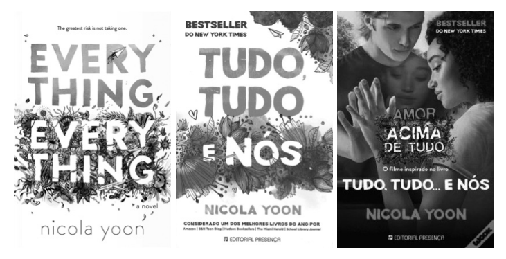
Figure 8 - Covers of Nicola Yoon first novel

Nicola Yoon, a Jamaican-born author living in the United States, published the bestseller Everything , everything (2015), whose immediate success made her a well-known author all over the world, and has since been adapted to the movies. The novel, which mixes various languages, revolves around the relationships between a super-protective mother and her teenage daughter intent on growing outside the limits imposed by her "disease" and her mother. The cinema adaptation brought the book back to the Portuguese top sales and the release of a new edition with a new cover (Fig. 8) include an emblematic image of the main characters, promoting the reader's recognition and interest.