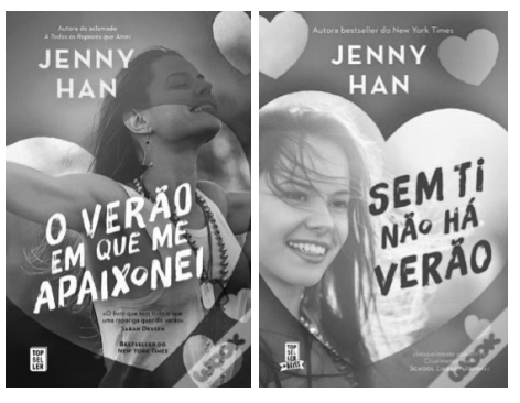
Figure 5 - Portuguese covers (Summer)