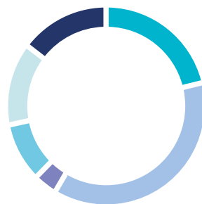
MSc THESES IN 2016 PER AREA

● Arts and Humanities (21%) ● Social Sciences (15%) ● Exact Sciences (4%) ● Health Sciences (10%) ● Life Sciences (13%) ● Engineering and Technology (37%)