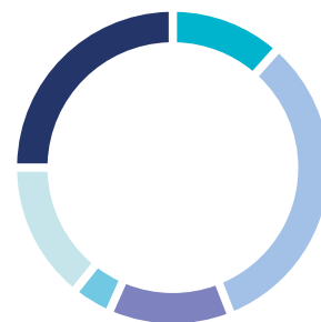
PHD THESES IN 2016 PER AREA

● Arts and Humanities (11%) ● Social Sciences (25%) ● Exact Sciences (13%) ● Health Sciences (4%) ● Life Sciences (14%) ● Engineering and Technology (33%)