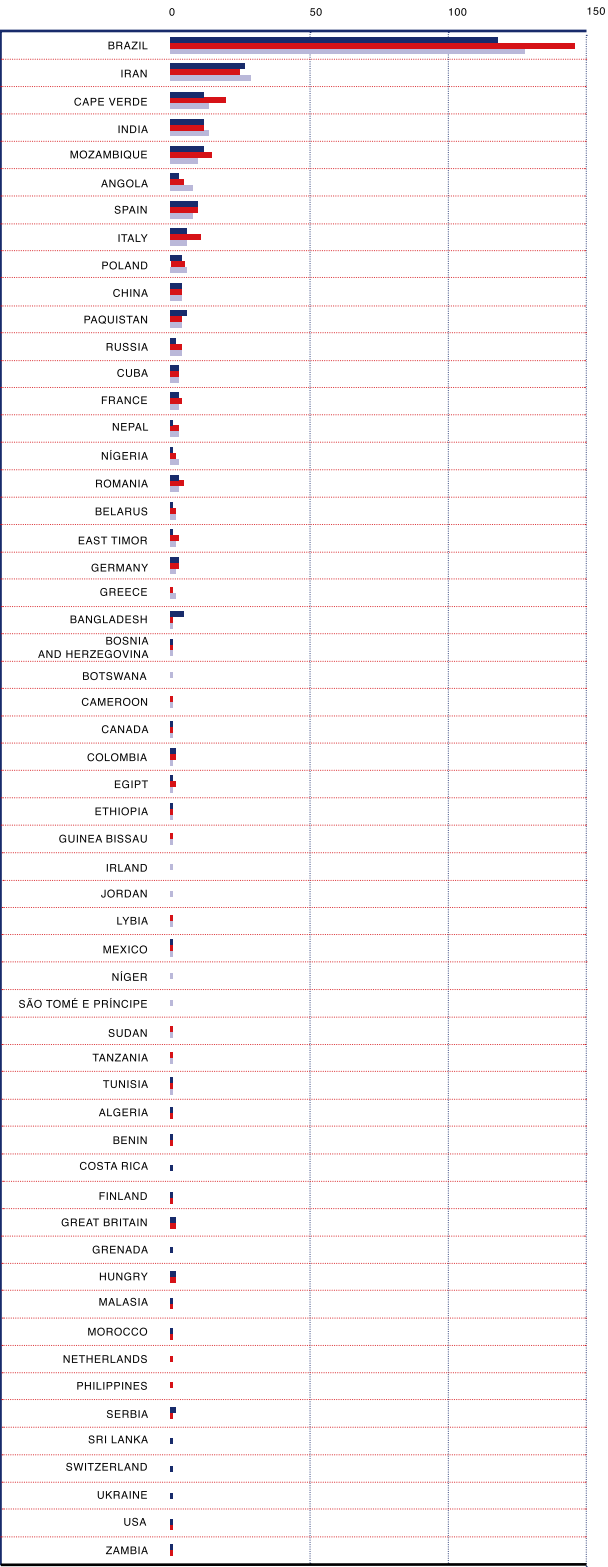
FOREIGN PhD STUDENTS BY NATIONALITY, 2012-2013