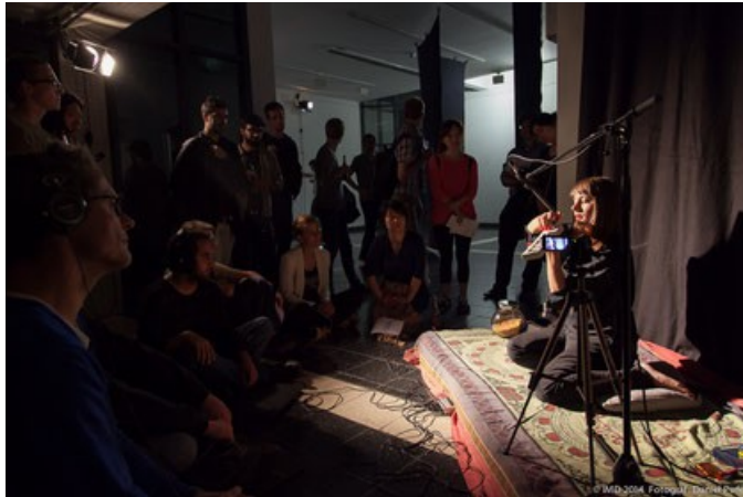
Figure III. http://www.neelehuelcker.de/installation

whispering and tapping, among many others. Enthusiasts avidly experiment with this newly acknowledged sensation, which includes making and/or watching videos with binaural sound recording that are produced with the sole intention to trigger ASMR in the viewers. 3