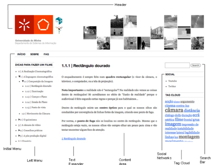
Fig. 3. The Learning object layout and its main sections

As the Stanford Guidelines for Web Credibility [22] points out “People quickly evaluate a site by visual design alone”, as such, it is really important to consider the interface design of an online product. The major features of this learning object are highlighted in the next scheme.