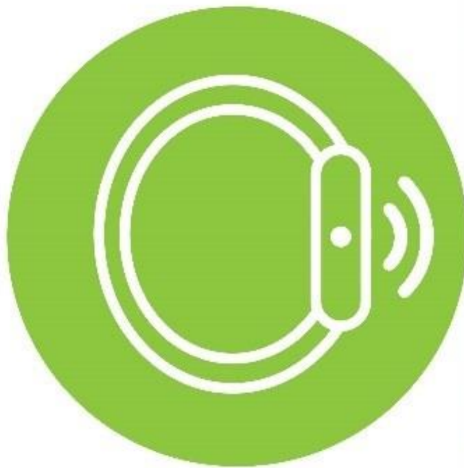
Figure 6. LOCUS Project's IoT-based smart bracelet sketch.