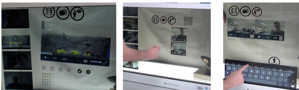
Figure 4. How to interact with a video entry with the user interface: A visitor can watch a video and rate it (on the left); watch other visitors' comments (in the middle), and generate a comment in the form of a video and/or text message (on the right). Source: (Díaz, Bellucci, Yuan, & Aedo, 2018)