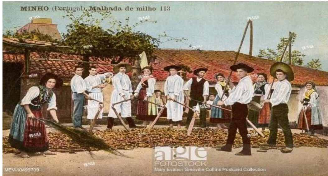
Figure 8. Corn threshing.

After the scanning, tourists will be able to participate in the “ Eira comunitária ” activities and pretend like villagers, as villagers usually do by using a specific stick for corn threshing. The tourists will pretend to have a stick in their hands, and they are threshing the corn in real life. The tourists will get points on their speed of threshing and numbers of corn threshing. The points will develop a playful scenario among the tourists and increase their willingness to participate in more activities and learn more about the place.