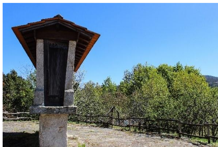
Figure 9. Espigueiro or Canastro (Amiais) (Corn storage place).

Furthermore, Radio-frequency identification (RFID) tags will be placed in different parts of Amiais village. The RFID tagging scheme will provide the tourist with the opportunity to explore more about Amiais village and its culture. For example, the tourist scans the tag that is placed on “ Desfolhada ” (a traditional activity).