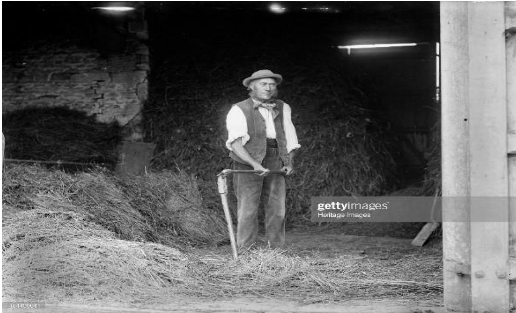
Figure 7. Corn threshing real image.

Furthermore, there is a folk Portuguese traditional place called Eira comunitária . In this context, Eira comunitária was a place where, traditionally, the people from the village gather for threshing corn, by adopting an ancient method. For threshing, there is a wooden made stick that is consisting of two sticks, one is long and second is short that is connected at one end by a short chain or rope. Likewise, the men and woman hold the long part of the stick and hit the small part that connected with a chain on the corn for corn threshing.