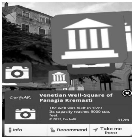
Figure 5. CorfuAR travel guide in action.

CorfuAR is a fully workable prototype mobile AR application. The CorfuAR has two main features: personalized content for users and facilitates the tourist through a navigation application. The presented application is designed for Android devices and has two versions, the first one personalized and the second non-personalized. The application takes care of tourists' points of interest, moreover, gives them a platform where they can interact through social communication with their friends, and family.