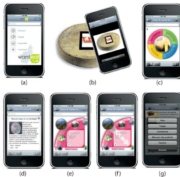
Figure 1. Example of the wheel on the iPhone. Source: (Cena, Biamino, Chiabrandò, & Fassio 2012)

This study was conducted by Cena, Biamino, Chiabrandò, & Fassio (2012). The main objective of this study was to develop an IoT-based social intelligence environment. Due to intelligent social capability, the objects tell stories, histories of objects and communicate with visitors for knowledge sharing. This study has a design that is based on a recipe of different ingredients. A first ingredient is a smart object that can manage and convey embedded information to visitors. The flow of information enhances communication level between object and visitors that builds a virtual social relation among the visitors and objects. The second ingredient is a social networking and web servicing. Likewise, social networking platform behaves as traditional social networking sites behave. The third ingredient was to develop a natural interaction between objects and visitors, which is enhancing the wellbeing and joyful experience. The last ingredient is people's experience during interaction with an object on different devices and a web-based platform called the continuum of experiences. The goal of all these ingredients is to develop a smart environment where people and objects can communicate with each other.