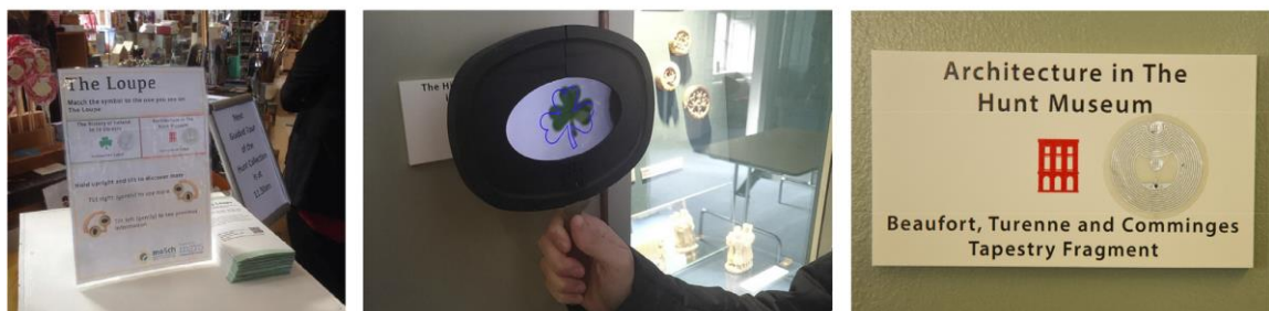
Figure 3. The Loupe was used at the Hunt Museum to get information for objects belonging to different thematic trails by matching different visual markers, e.g. a shamrock for a historical trail or the shape of a building for a trail on architecture.

The primary responsibility of context-awareness function is to sense and respond according to the situation. The prototype application had been installed in different locations such as WWI trenches (install Bluetooth base loudspeaker) the Hague and Atlantic temporary wall (interactive, personalized postcard) Hunt museum (Loupe is mobile-based augmented reality application) and Museo Della (the interactive plinth) for the case study.