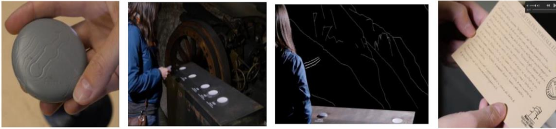
Figure 2. Voices from the Past in Fort Pozzacchio is a permanent installation at the Museo Storico Italiano Della Guerra. At the entrance, the visitor receives a pebble used to activate content at different stations along with the visit, when leaving the visitor returns. Source: (Not & Petrelli 2018)

Similarly, in the smart scenario, every object has embedded with story or history that facilitates the visitors while they visit the online or onsite scenario. In this scenario, the visitors can personalize the tangible interaction in cultural heritage by adaptivity and context awareness. The adaptivity allows the visitors to customize the application settings according to their will.