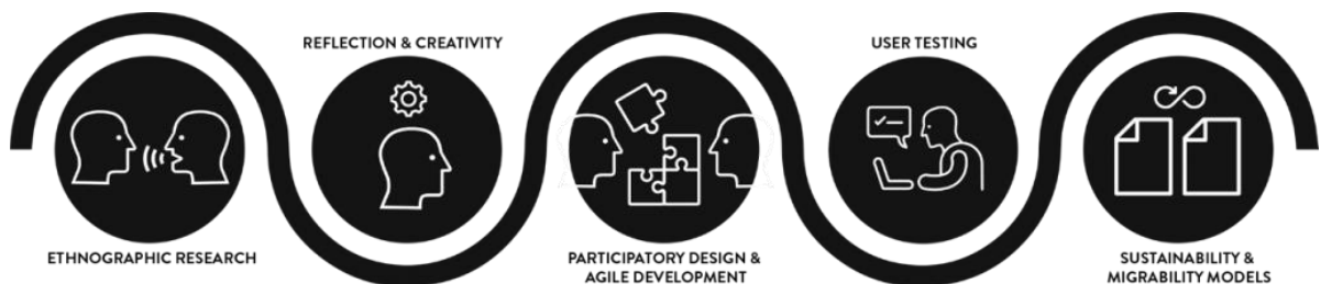
Fig. 10. LOCUS development stages.

This stage will encompass assessments, discussion, interpretation, and ties all gather knowledge that was obtained from the ethnographic stage. Furthermore, LOCUS will conduct some brainstorming session with tourist, stakeholders, and inhabitants. These sessions will help to imagine a scenario that will be based stone for IoT playful and intergenerational experience.