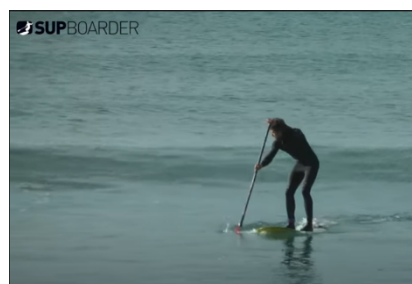
Figure 2 – Paddlesurfer catching a wave

Figures 2 and 3 show the process of catching and surfing a wave. As stated above, the company needs to position itself in the right place to be able to surf the market/wave. Every time the buyer persona/avatar (Hemp, 2006) is not well identified (rocky spot, flat water or bad weather), or the business lacks sufficient international funds (poorly inflated or punctured board or broken paddle), or the paddling is just not synced, putting the board in the wrong place at the moment the sale is being closed/where the wave breaks, the MSME will lose the deal and will not be able to ride the wave and profit from internationalization.