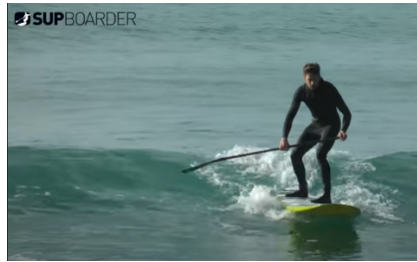
Figure 3 – Paddlesurfer surfing a wave

From the lead author's own recent professional experience (2021), a more concrete example may be given whose details cannot be disclosed: an international marketing campaign to introduce a new product was planned, using top-notch outsourcing facilities. Several thousand euros were invested in the project.