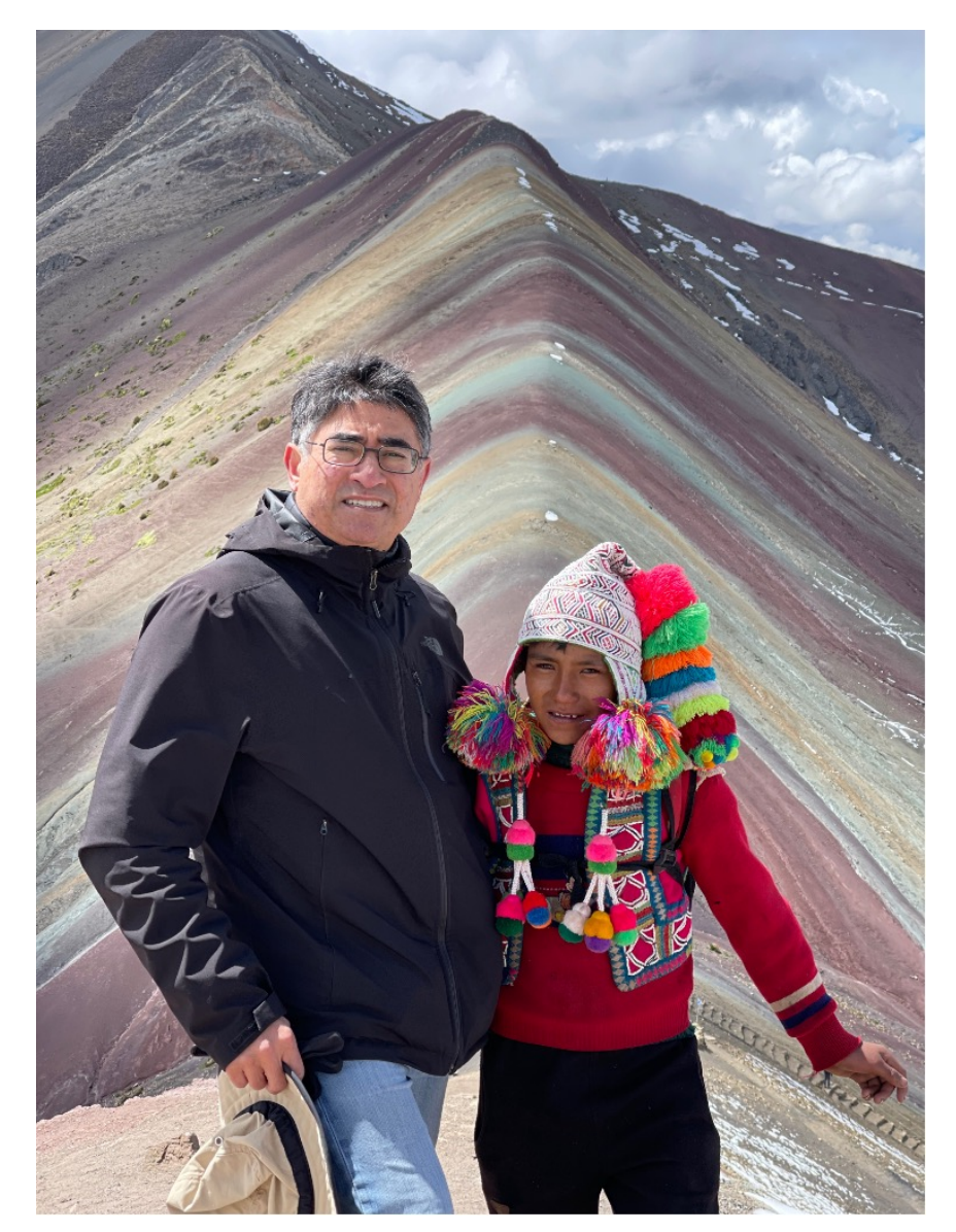
Figure 1 - At the top of Rainbow Mountain, Peru, with a local

At Lake Titicaca the leader of the group stated that it was a shame to see such a big hotel empty. Due to the COVID-19 situation. In Lima our hotel was also empty. What a shame.