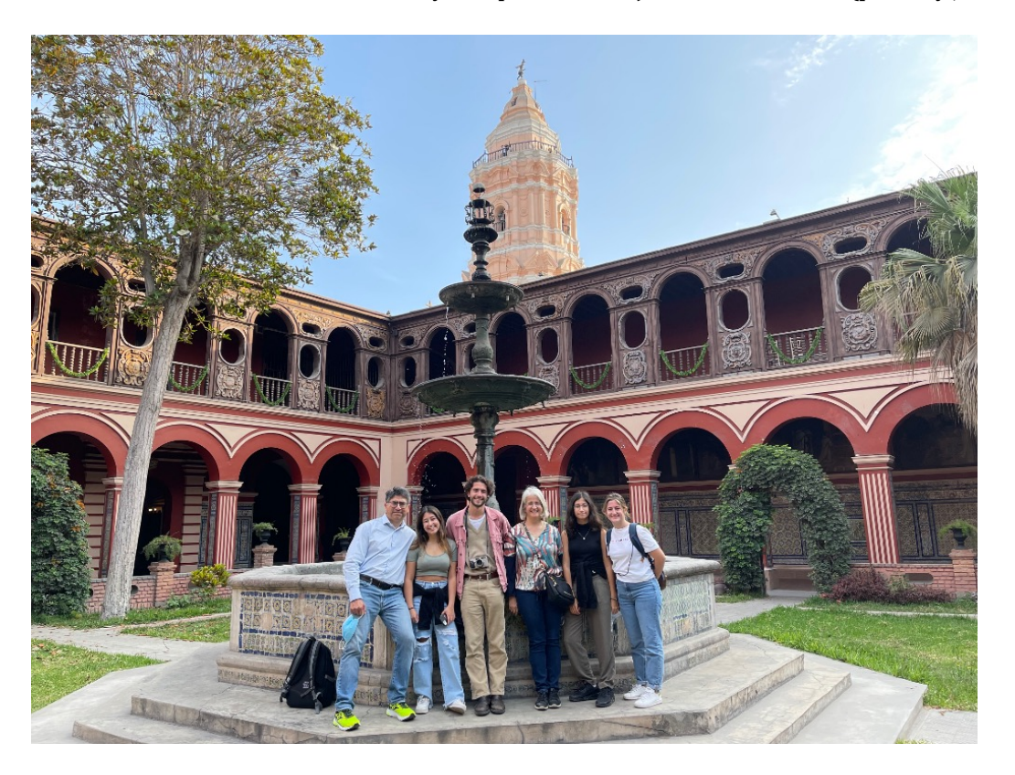
Figure 4 - Architectural wonders in Lima, Peru - a legacy of the Spanish

Much as is seen in other parts of Central and South America, foreign colonizers from the Iberian Peninsula have left a mark (North, 2005). The extraction mentality (North, 2005) persists perhaps to this day – whereby