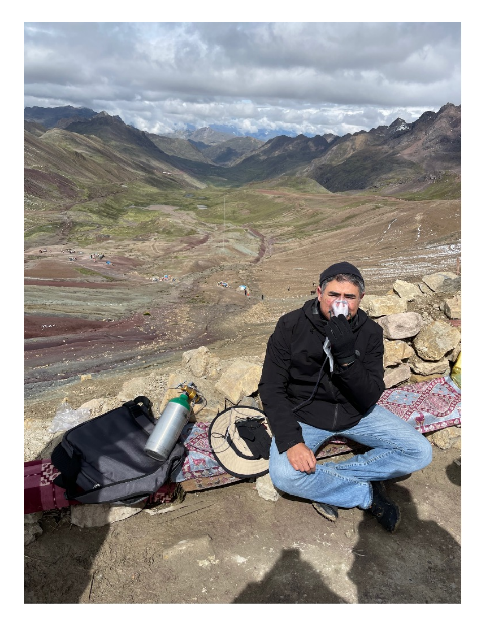
Figure 2 – At the top of Rainbow Mountain, Peru, I was given oxygen – twice (altitude 5,036 meters)