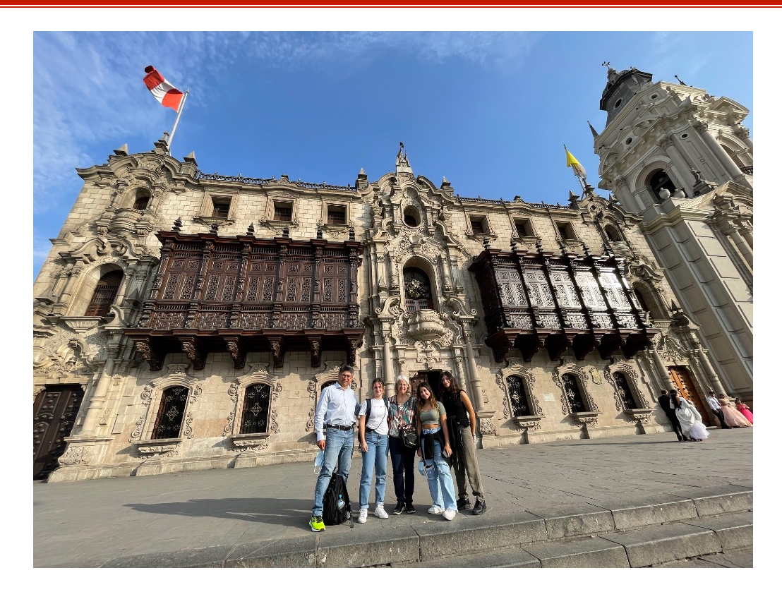
Figure 3 - Outside the Cathedral in Lima, Peru, built by the Spanish - A major tourist attraction